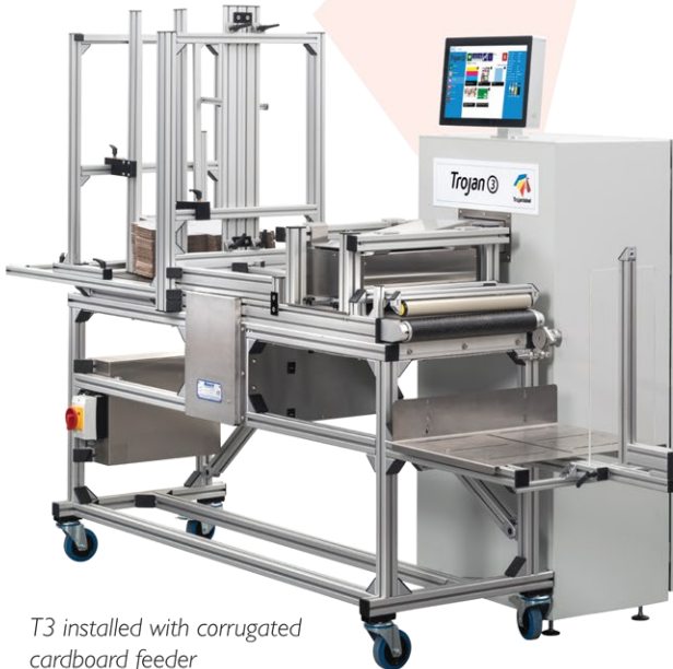
T3 installed with corrugated cardboard feeder