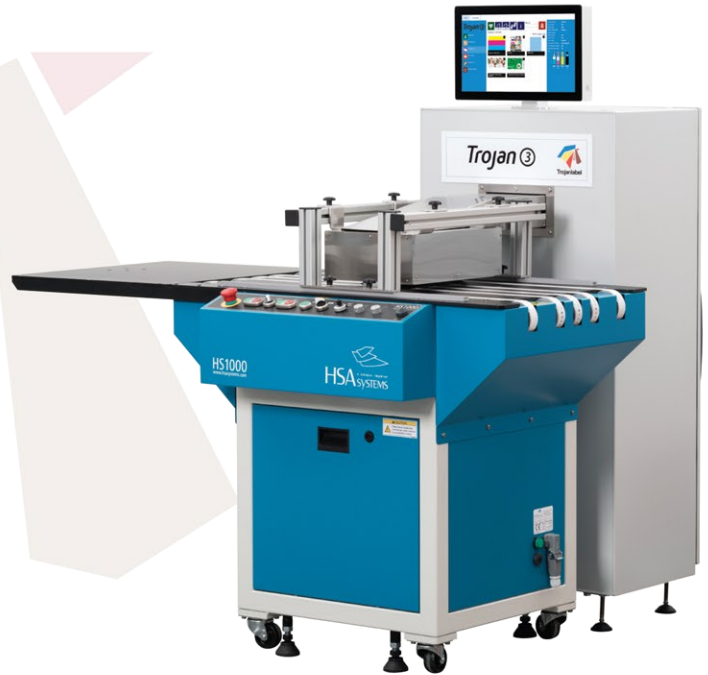
T3 mounted on mail table